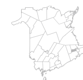
Community Riverview and Coverdale