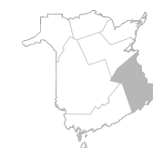
Zone 1 Moncton and South-East Area