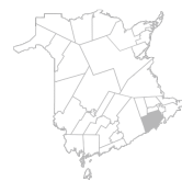
Community Hillsborough, Riverside-Albert, Alma Area