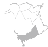
Zone 2 Fundy Shore and Saint John Area