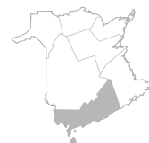
Zone 2 Fundy Shore and Saint John Area