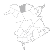
Community Campbellton, Atholville, Tide Head Area