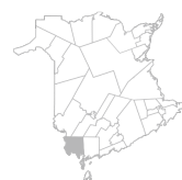
Community St. Stephen, Saint Andrews, Campobello Island Area