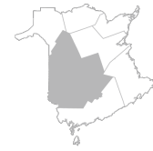
Zone 3 Fredericton and River Valley Area