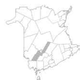
Community New Maryland, Kingsclear, Lincoln Area