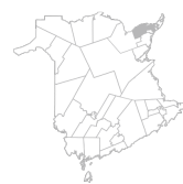
Community Caraquet, Paquetville, Bertrand Area