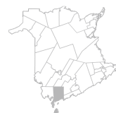
Community St. George, Grand Manan, Blacks Harbour Area