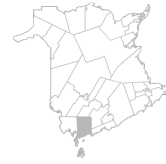
Community St. George, Grand Manan, Blacks Harbour Area