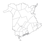
Community Saint John, Simonds and Musquash