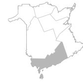
Zone 2 Fundy Shore and Saint John Area