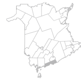
Community Saint John, Simonds and Musquash