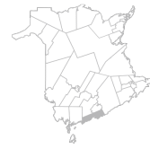
Community Saint John, Simonds and Musquash