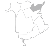
Zone 6 Bathurst and Acadian Peninsula Area