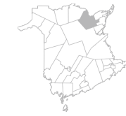
Community Bathurst, Beresford, Petit- Rocher Area