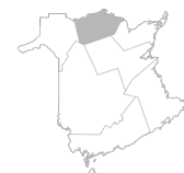
Zone 5 Restigouche Area