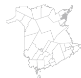
Community Tracadie and Saint-Isidore