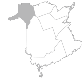
Zone 4 Madawaska and North-West Area