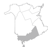
Zone 2 Fundy Shore and Saint John Area