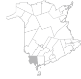
Community St. Stephen, Saint Andrews, Campobello Island Area