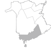
Zone 2 Fundy Shore and Saint John Area