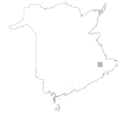
Hospital The Moncton Hospital