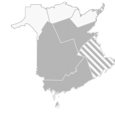
RHA Horizon Health Network