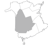
Zone 3 Fredericton and River Valley Area