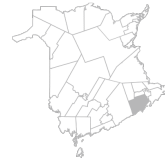
Community Hillsborough, Riverside-Albert, Alma Area