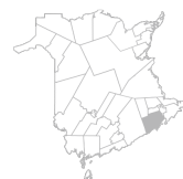
Community Hillsborough, Riverside-Albert, Alma Area