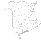
Community Saint John, Simonds and Musquash