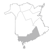
Zone 2 Fundy Shore and Saint John Area