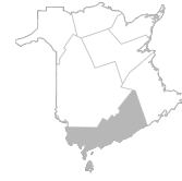
Zone 2 Fundy Shore and Saint John Area