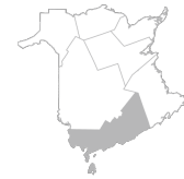
Zone 2 Fundy Shore and Saint John Area