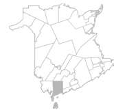
Community St. George, Grand Manan, Blacks Harbour Area