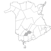
Community Oromocto, Gagetown, Fredericton Junction Area