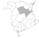
Community Miramichi, Rogersville, Blackville Area