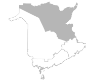
School district Anglophone North