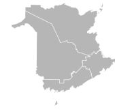
Education sector Anglophone