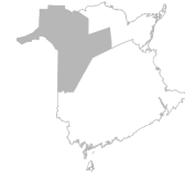
School district Francophone Nord-Ouest