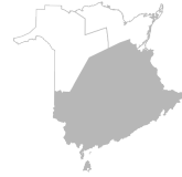
School district Francophone Sud