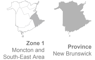
Zone 1 Moncton and South-East Area