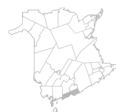
Community Saint John, Simonds and Musquash