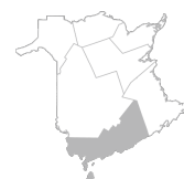
Zone 2 Fundy Shore and Saint John Area