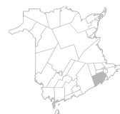
Community Hillsborough, Riverside-Albert, Alma Area