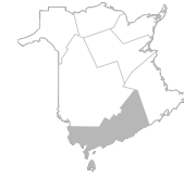
Zone 2 Fundy Shore and Saint John Area