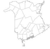
Community Saint John, Simonds and Musquash