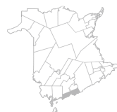
Community Saint John, Simonds and Musquash