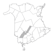
Community New Maryland, Kingsclear, Lincoln Area