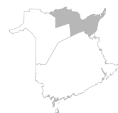
School district Francophone Nord-Est