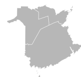
Education sector Francophone