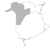
School district Francophone Nord-Ouest