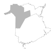
School district Francophone Nord-Ouest