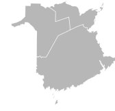
Education sector Francophone