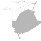
School district Francophone Sud