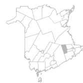
Community Salisbury and Petitcodiac