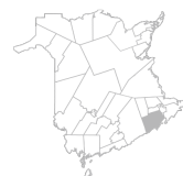
Community Hillsborough, Riverside-Albert, Alma Area