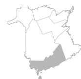
Zone 2 Fundy Shore and Saint John Area