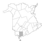
Community St. George, Grand Manan, Blacks Harbour Area