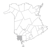
Community St. Stephen, Saint Andrews, Campobello Island Area