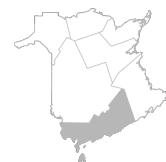
Zone 2 Fundy Shore and Saint John Area