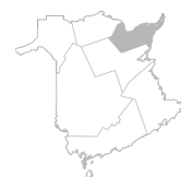
Zone 6 Bathurst and Acadian Peninsula Area