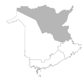
School district Anglophone North