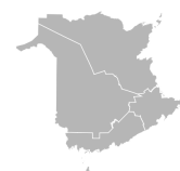
Education sector Anglophone