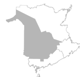
School district Anglophone West