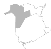
School district Francophone Nord-Ouest