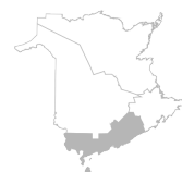
School district Anglophone South