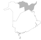
School district Francophone Nord-Est