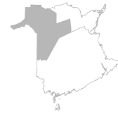
School district Francophone Nord-Ouest