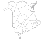
Community Tracadie and Saint-Isidore