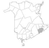
Community Hillsborough, Riverside-Albert, Alma Area