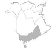
Zone 2 Fundy Shore and Saint John Area