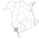
Community St. Stephen, Saint Andrews, Campobello Island Area